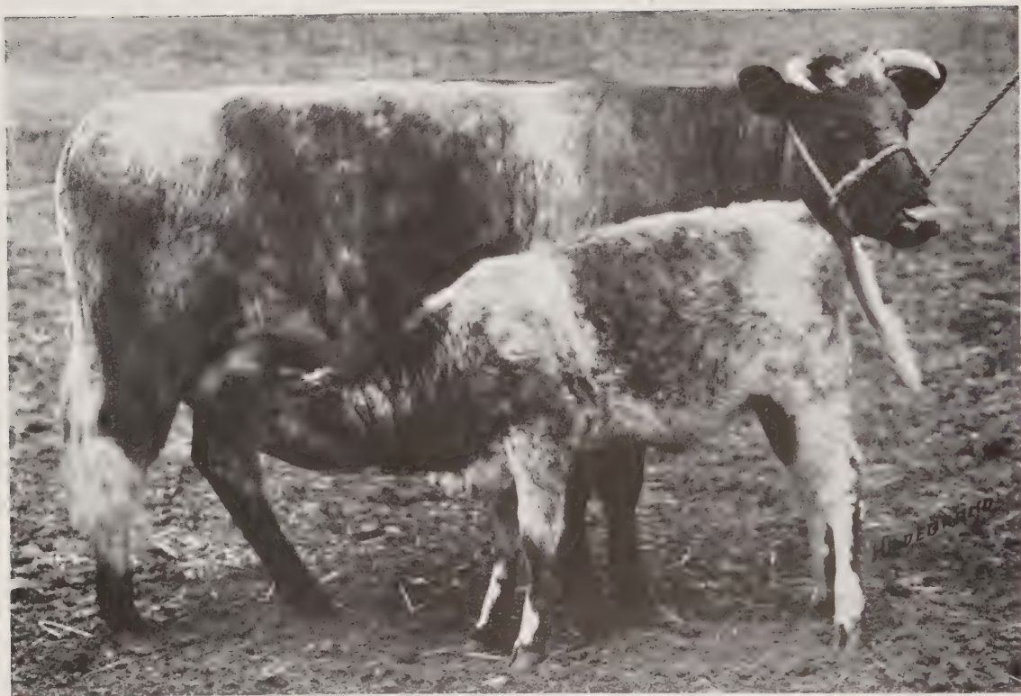
COLUMBIA 11TH AND HEIFER CALF.